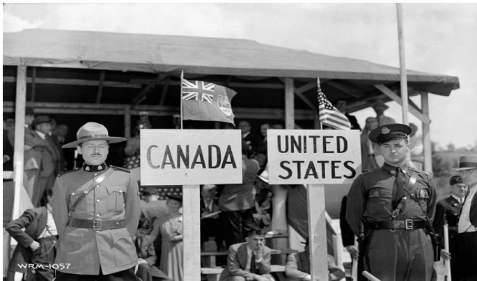
REGION XI – Crossing Borders

But now is not the time to rest on our laurels. We really need to keep the momentum going so let's get out there to identify projects that could be submitted for the Regional Competition at the CRC in Regina, in May 2010. As a reminder, for more information on the ASHRAE Technology Awards, go to http://www.ashrae.org/publications/detail/14704